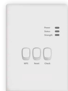
Aquearea Smart Cloud wall unit

Images for illustration purposes only. Actual units may vary.