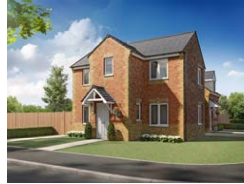
The Wexford 3 bedroom semi-detached home