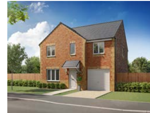
The Waterford 4 bedroom detached home