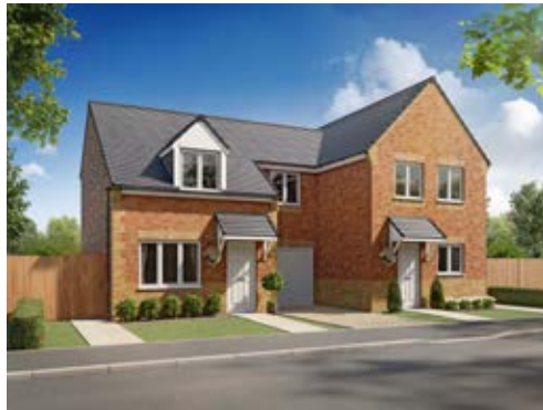
The Fergus 3 bedroom semi-detached home