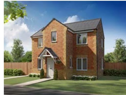
The Renmore 3 bedroom detached home