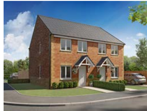
The Lisburn 3 bedroom semi-detached home