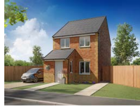
The Kilkenny 3 bedroom detached home