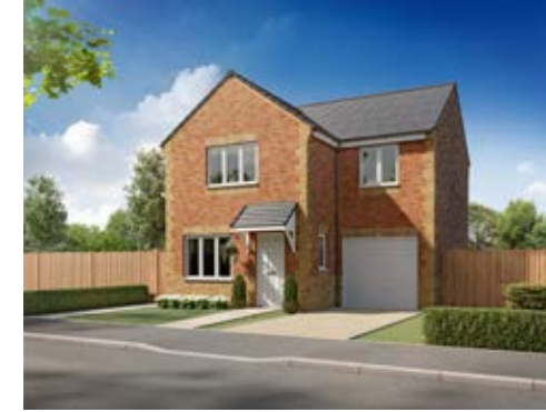
The Kildare 3 bedroom detached home