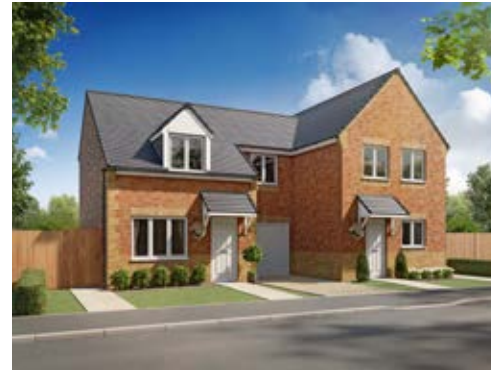
The Fergus 3 bedroom semi-detached home