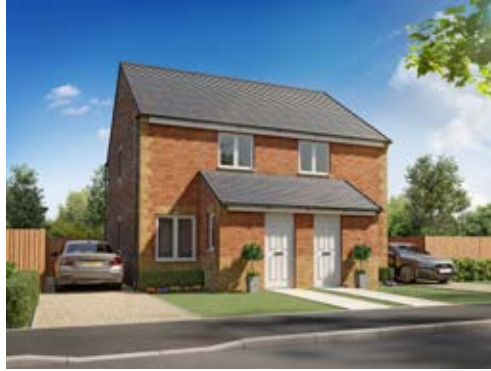
The Kerry 2 bedroom semi-detached home