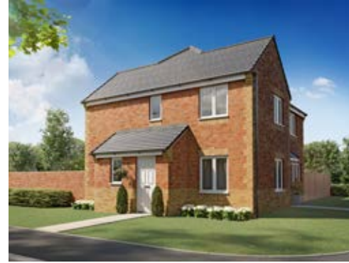
The Mayfield 2 bedroom semi-detached home