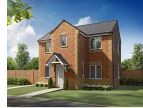
The Renmore 3 bedroom detached home