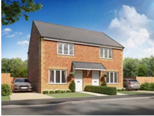
The Cork 2 bedroom semi-detached home