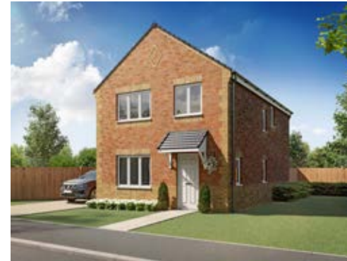
The Longford 4 bedroom detached home