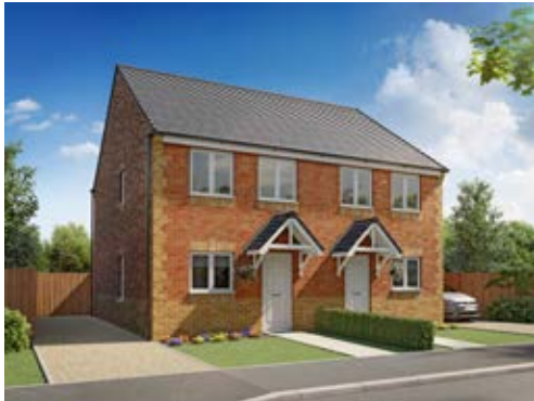
The Tyrone 3 bedroom semi-detached home