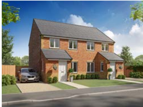
The Wicklow 3 bedroom semi-detached home