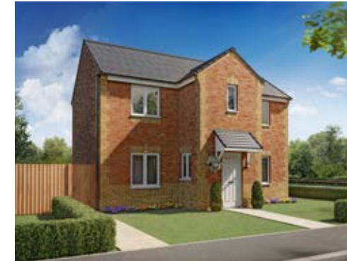
The Carlow 4 bedroom detached home